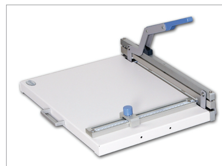
Light and compact tabletop unit.