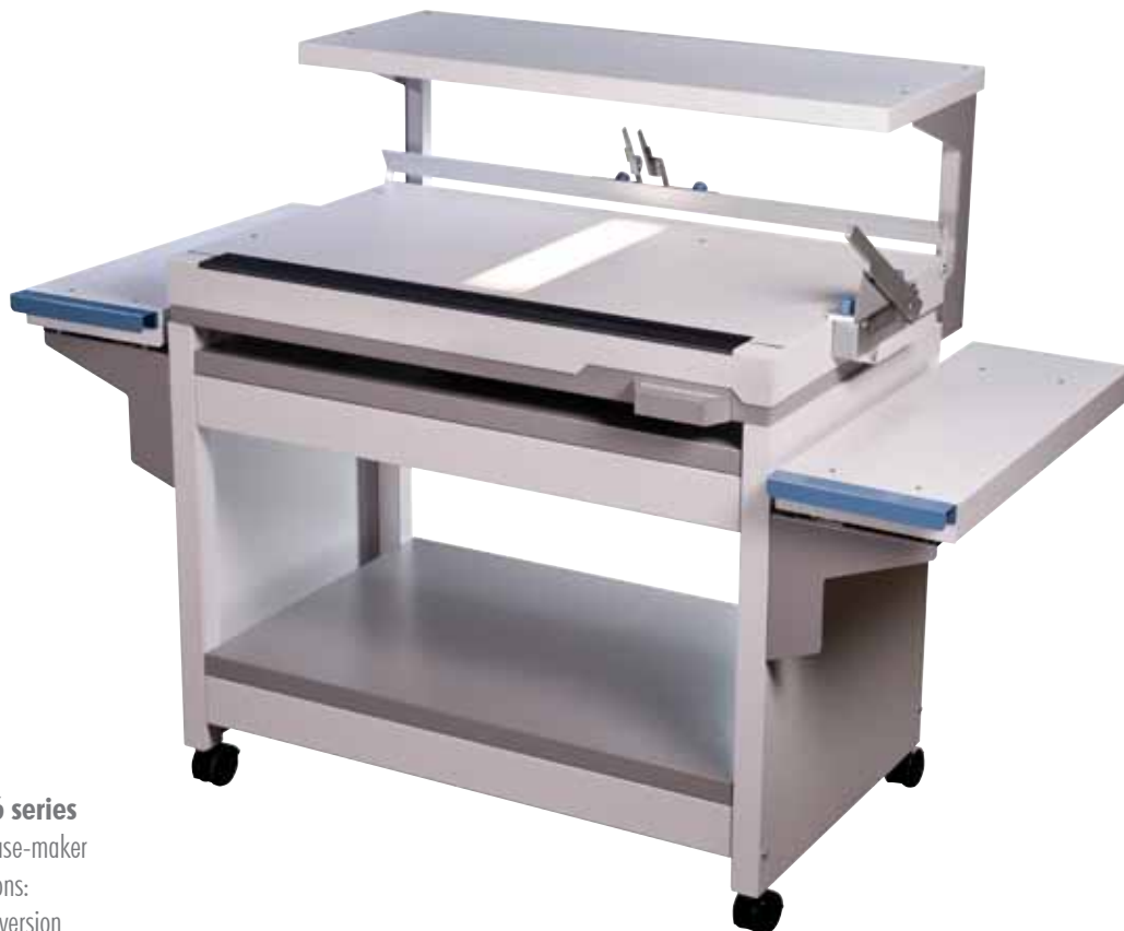
CASEMATIC a46 series Semi automated case-maker Two different versions: • a46z table top version • a46a stand alone version