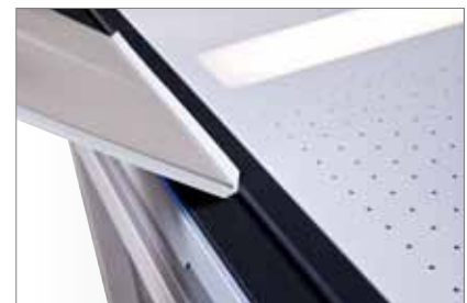
Edge folding unit.