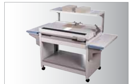
Casematic a46a : Stand-alone version