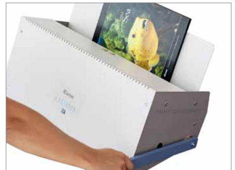
Easy to use.