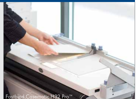
Fastbind Casematic H32 Pro™

Once the cover is made, you can finish the book using a Fastbind Binding machine. Fastbind provides all the necessary materials and supplies to produce hard covers for the print-on-demand environment.